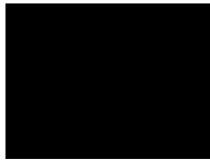
Figure 1.1: Dummy figure

Hello, here is some text without a meaning. This text should show, how a printed text will look like at this place. If you read this text, you will get no information. Really? Is there no information? Is there a difference between this text and some nonsense like »Huardest gefburn«? Kjift – Never mind! A blind text like this gives you information about the selected font, how the letters are written and the impression of the look. This text should contain all letters of the alphabet and it should be written in of the original language. There is no need for a special contents, but the length of words should match to the language.